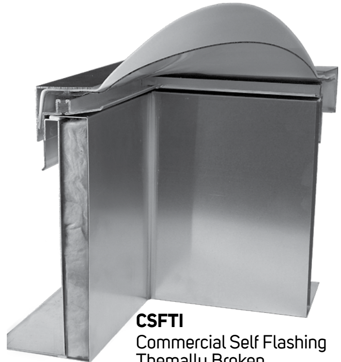
CSFTI Commercial Self Flashing Themally Broken & Insulated